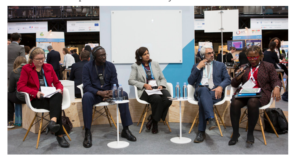
Paris Peace Forum high-level panel, "Fiscal Erosion and Tax Evasion: Connecting the Dots", discussing the impact of TIWB programmes at the Grande Halle de la Villette on 12 November 2018.

In November, the TIWB initiative was proudly featured among key global projects fostering the peace through international co-operation at the recently concluded Paris Peace Forum. The Forum presented an excellent