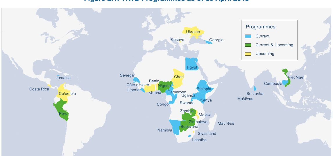
Figure 2.1. TIWB Programmes as of 30 April 2018

Partner Administration support for TIWB programmes is also expanding with new partners such as Belgium, India and South Africa joining existing Partner Administrations from France, Germany, Italy, Kenya, the Netherlands, Nigeria, Spain, and the United Kingdom.